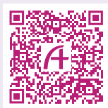
Service Information 服務詳情