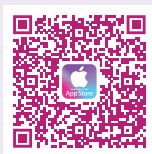
Download App 下載應用程式